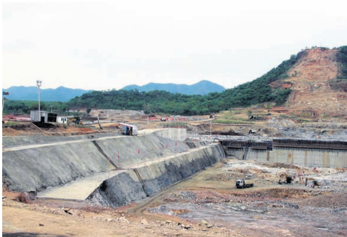
In this June 28, 2013 file photo, construction work takes place, at the site of the Grand Ethiopian Renaissance Dam near Assosa, Ethiopia.

Egypt's Irrigation Ministry said in a statement late Saturday that Ethiopia was looking to renegotiate a